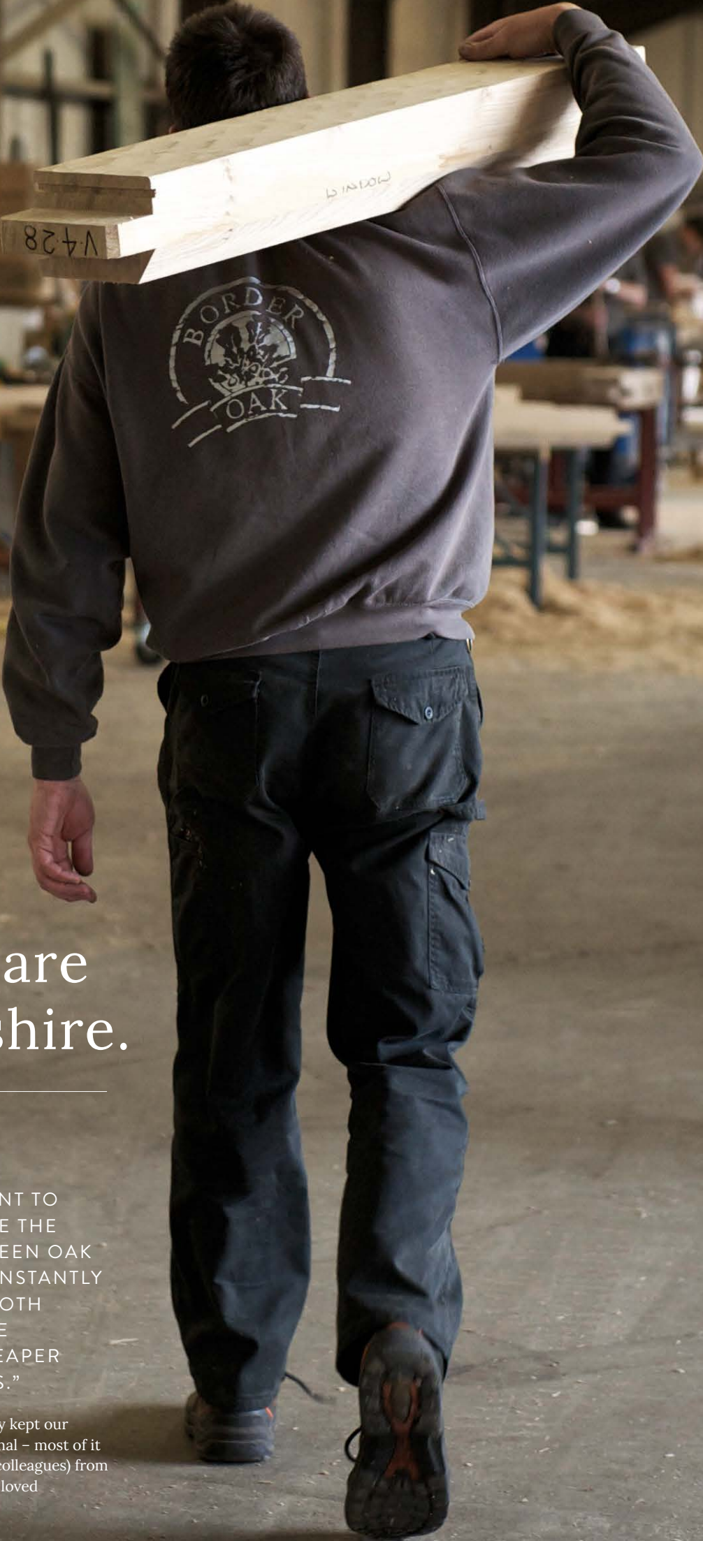
Border Oak are FSC and PEFC accredited and are committed to the ethical and sustainable procurement of all our timber

We have consciously and deliberately kept our automated modern machinery minimal - most of it dates (as do many of our best loved colleagues) from the 1950's and yet, (just like our best loved colleagues) it performs admirably.