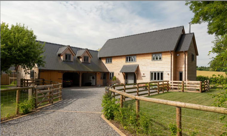
Foxwhelp Barn - Internal oak frame with SIPs encapsulation finished in horizontal weatherboarding