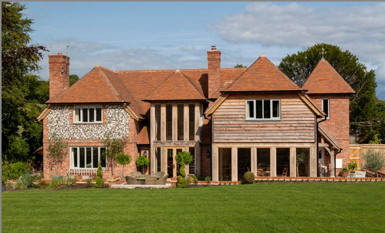
The Old Forge - Combined construction faced with brick, flint and weatherboard