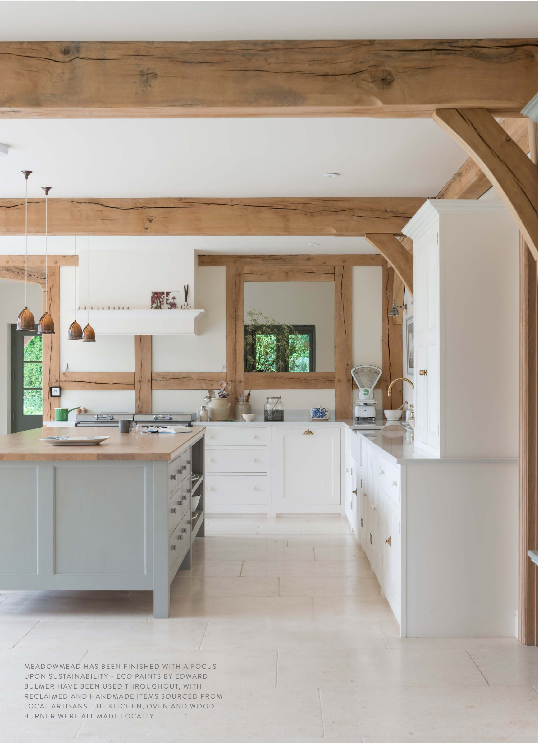
Border Oak hold regular open days at Meadowmead and St. Michaels Cottage – please contact the office for more information.

MEADOWMEAD HAS BEEN FINISHED WITH A FOCUS UPON SUSTAINABILITY - ECO PAINTS BY EDWARD BULMER HAVE BEEN USED THROUGHOUT, WITH RECLAIMED AND HANDMADE ITEMS SOURCED FROM LOCAL ARTISANS. THE KITCHEN, OVEN AND WOOD BURNER WERE ALL MADE LOCALLY