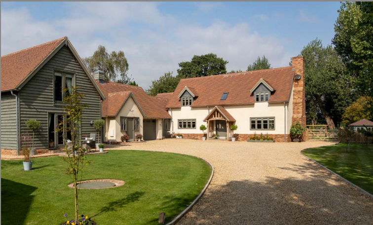
Willow Cottage - Internal oak frame with SIPs encapsulation finished in high performance render

Border Oak houses are designed by us to meet the requirements of your site and your budget - as well as the surrounding area and specific planning situation. Here are just three examples demonstrating how different exterior materials can radically alter the look of our properties.