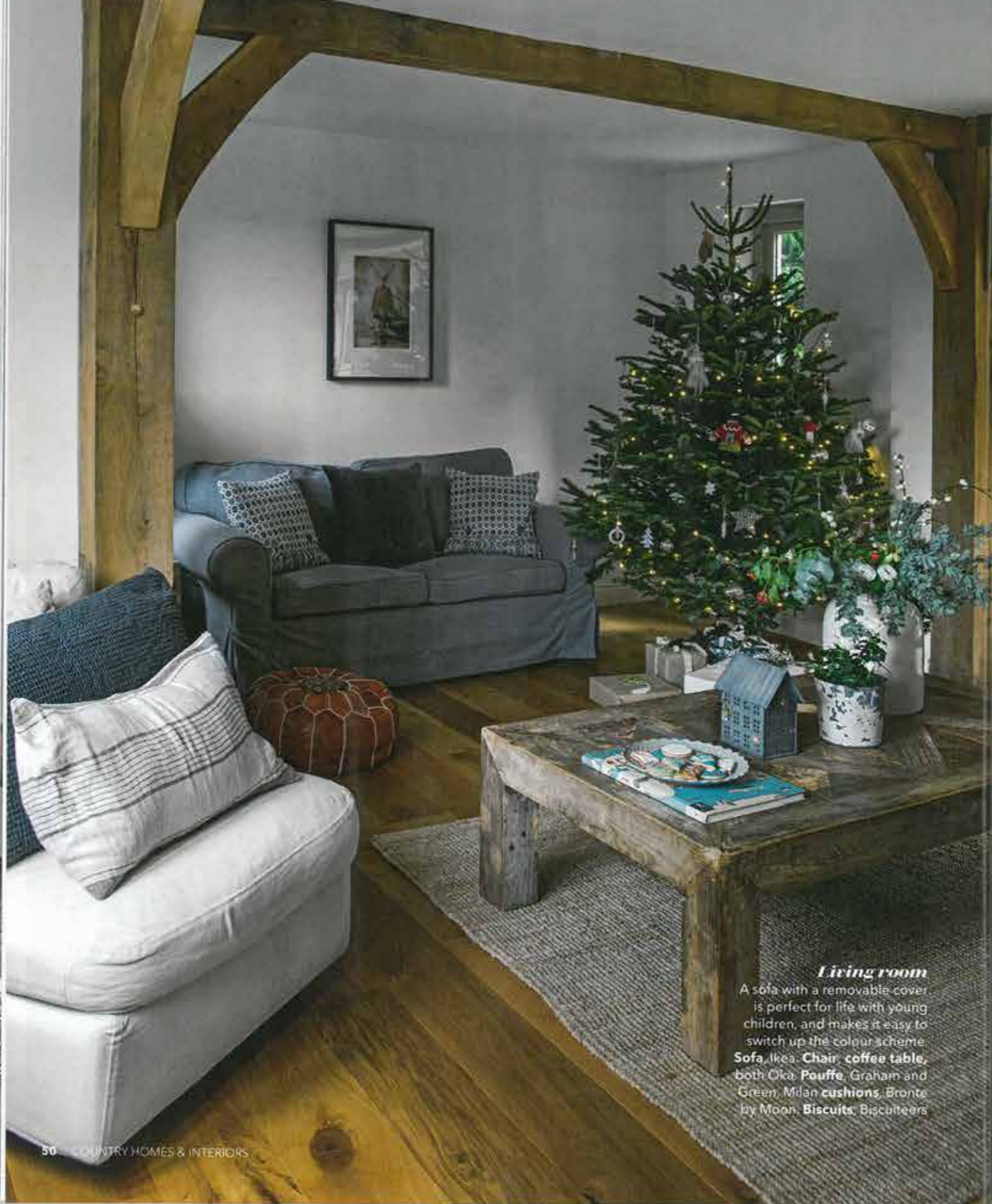
Living room A sofa with a removable cover is perfect for life with young children, and makes it easy to switch up the colour scheme. Sofa , Ikea. Chair , coffee table, both Oka. Pouffe , Graham and Green. Milan cushions , Bronte by Moon. Biscuits , Biscuiteers

“I LIKE WHITE WALLS MIXED WITH NATURAL TEXTURES - THAT WAY THE HOME CAN SPEAK FOR ITSELF”