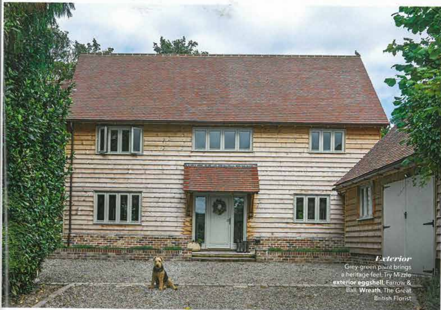
Exterior Grey-green paint brings a heritage feel. Try Mizzle exterior eggshell, Farrow & Ball. Wreath , The Great British Florist

but it was perfect timing for us. It's also a huge amount of work getting planning permission, so the fact that it already had it in place was a big plus.'